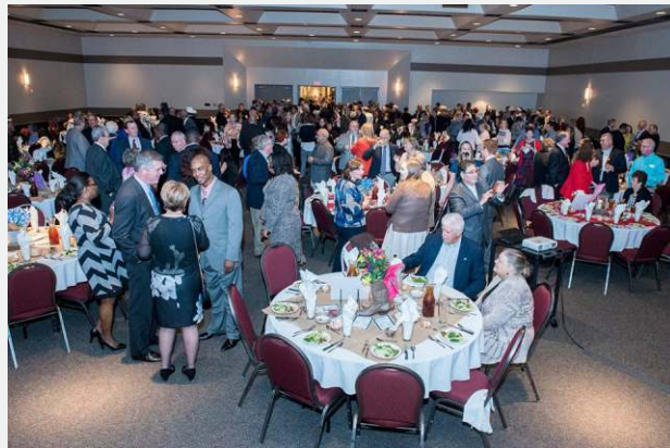
Approximately 400 were in attendance at the banquet!