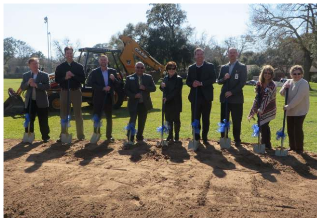
Brazosport ISD Officials, Students and Community Leaders participated in a ceremonial groundbreaking for the new school which is scheduled to be open in 2017.