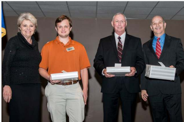
Congratulations to our top five ambassadors L to R: