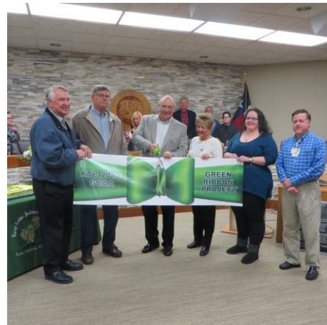
Keep Texas Beautiful GCAA & Green Ribbon Project Dedication