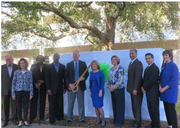
Brazosport College and Freeport LNG officials dedicated the new Brazosport College Freeport LNG Crafts Academy. The 43,000 square-foot facility is located in the Science Technology Corridor at Brazosport College.