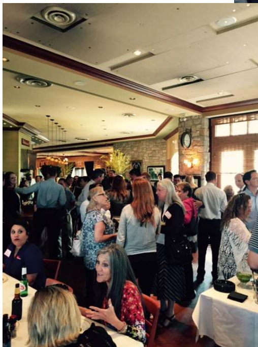
Members enjoyed networking at the mixer.