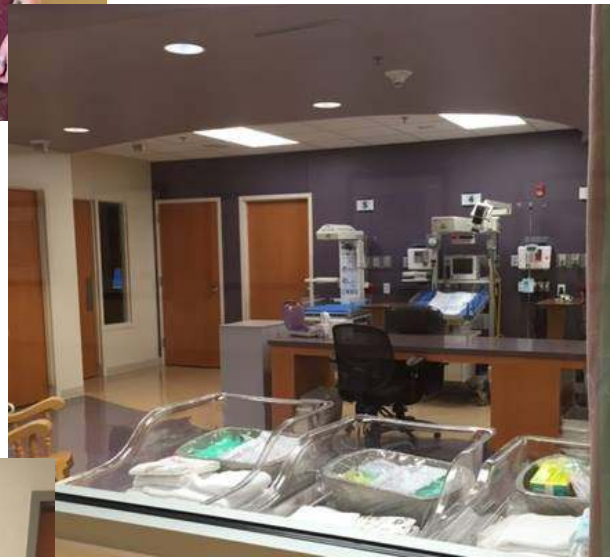
Peklo Women's Pavilion Nursery.