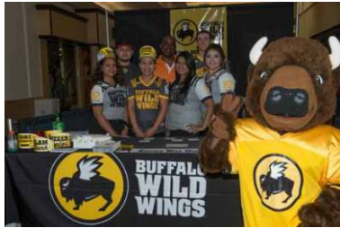
Buffalo Wild Wings 200 E. Hwy. 332, Ste. A, Lake Jackson 979-297-3614

Please visit these vendors in your day-to-day activities.