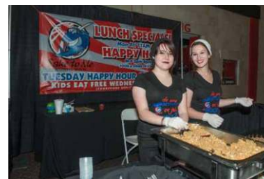
Sake' To Me 100 Hwy. 332 W., Ste. 1386, Lake Jackson 979-316-3950