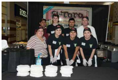
El Toro 120 Commerce Street, Clute 979-265-5361