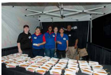
Sonic Drive-In 142 N. Hwy. 288-B, Clute 979-265-8569