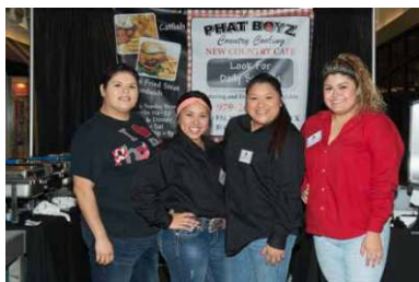
Phat Boyz Country Cooking 1990 FM 2004, Richwood 979-824-4316