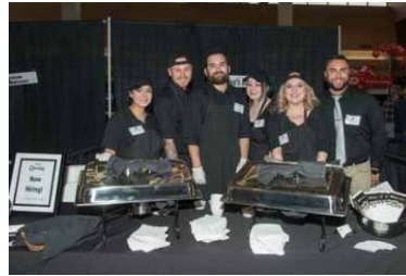
Carino's Italian 106 E. Hwy. 332, Lake Jackson 979-285-3570