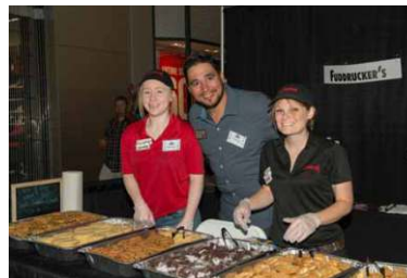
Fuddrucker's 206 Hwy. 332 W., Lake Jackson 979-529-9025