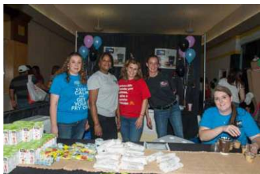
McDonald's 1028 Dixie Drive, Clute 979-297-3824

Please visit these vendors in your day-to-day activities.