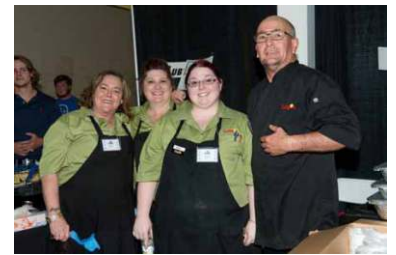
Luby's 125 West Way, Lake Jackson 979-297-2216