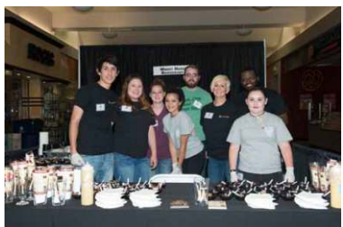
Wurst Haus Restaurant 102 This Way, Lake Jackson 979-297-3003