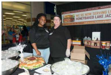
HoneyBaked Ham 201 Hwy. 332 W., Lake Jackson 979-299-7400