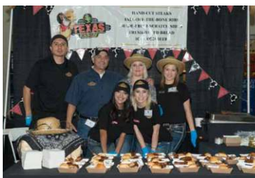
Texas Roadhouse 100 Hwy. 332, Ste. 1126, Lake Jackson 979-299-7427