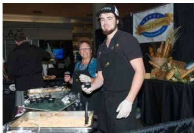
Coastal Catering 16603 Jamaica Beach, Galveston 979-798-1119