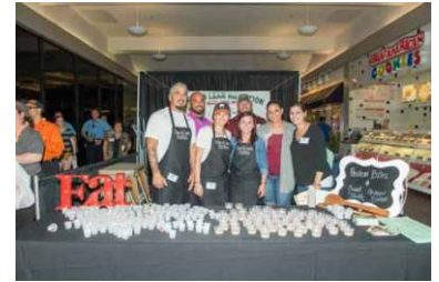
Clean & Lean Nutrition 425 S. 17th St., West Columbia 979-345-3323