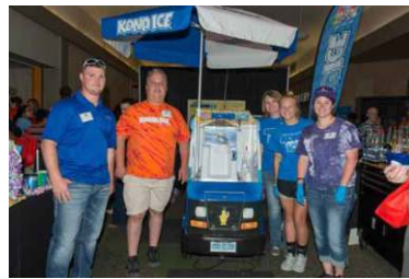
Kona Ice of South Brazoria County P.O. Box 297, Brazoria 979-798-5662