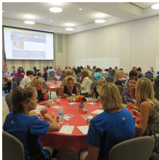
Approximately 100 women attended the Women in Business Luncheon June 29 th