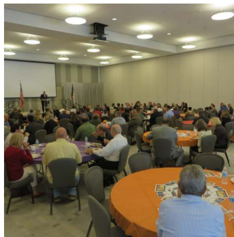
Approximately 200 members attended the State of the Community Luncheon in October.