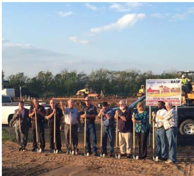
City of Clute Fire & EMS Station