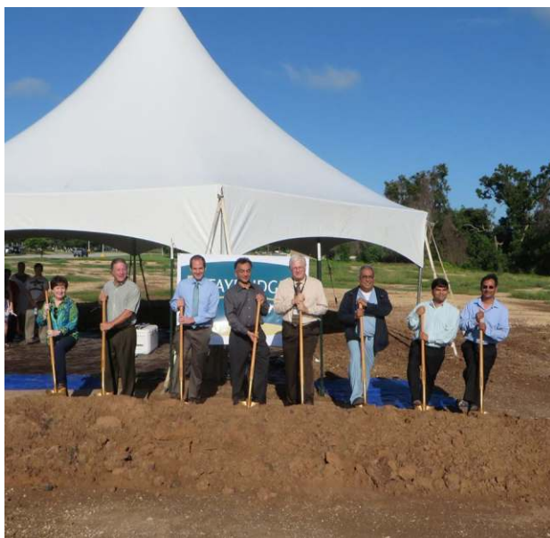
Staybridge Suites Groundbreaking 981 FM 2004 at Brazos Mall Complex Lake Jackson, TX 77566