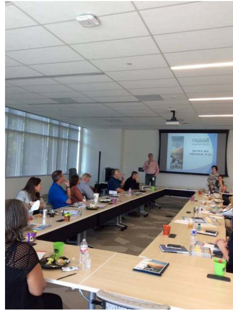
The Board of Directors brainstormed issues to address in the 2017 Strategic Plan.