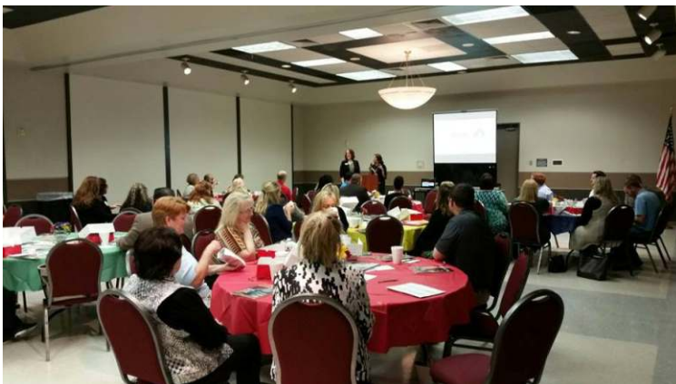
There were over 50 in attendance