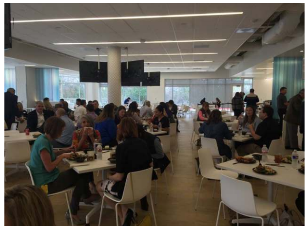
There were over 75 in attendance