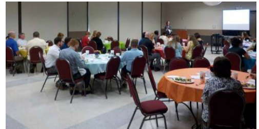
Thank you to our meeting sponsors First State Bank-Clute & Plantation Park Apartments