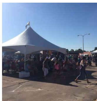
A huge crowd attended the IMG Party on the Patio & Network Mixer