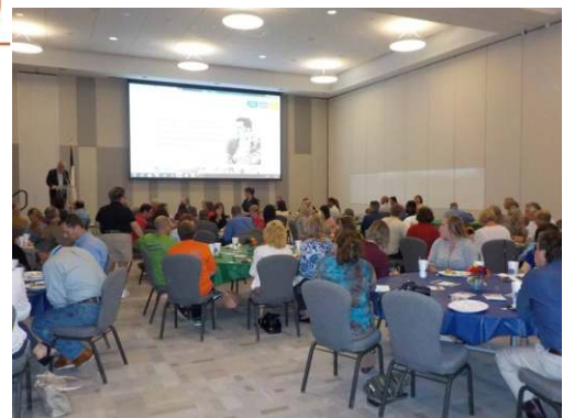
Thank you to our Major Sponsor, TDECU Business Services and our Table Sponsors: BASF Corp., Cordoba Law Firm, PLLC, The Dow Chemical Company, Gateway Mortgage Group and Teal Construction Company