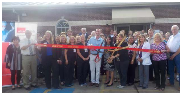
UTMB Urgent Care 2327 E. Hwy. 35, Angleton 979-849-9557 www.utmbhealth.com/services/uc-er/urgent-care Urgent Care Facility