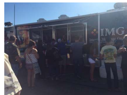
Integrity Mortgage Group served 1500 pounds of crawfish to their guests.