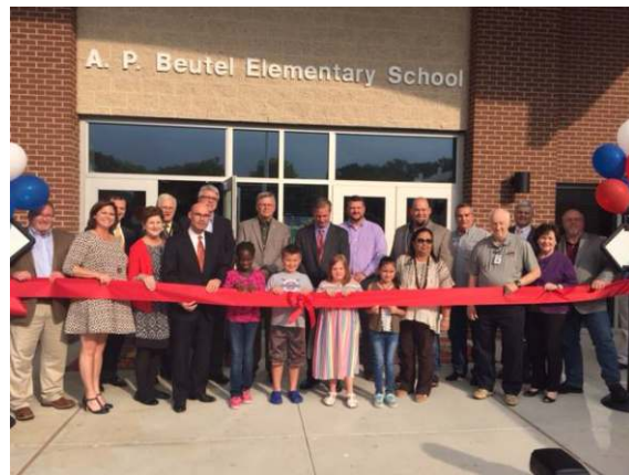
The Brazosport Area Chamber participated in the Opening Ceremony and Ribbon Cutting for the new A.P. Beutel Elementary School.