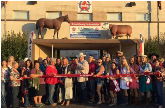
The Brazosport Area Chamber participated in the Opening Ceremony and Ribbon Cutting for the 2017 Brazoria County Fair.