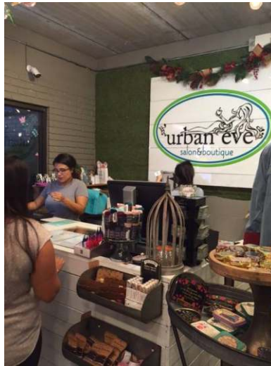
UrbanEve Salon & Boutique offers many unique gifts and services.