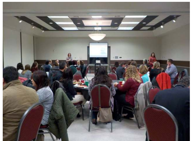
Many thanks to BASF Corp. and The Dow Chemical Company for sponsoring the December B.P.N meeting.