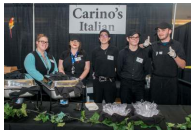
CARINO'S ITALIAN 106 E. Hwy. 332, Lake Jackson 979-285-3570