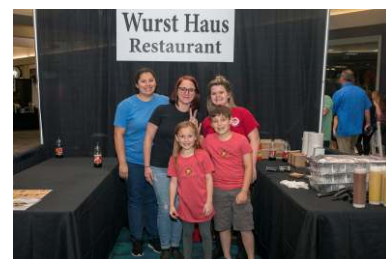
WURST HAUS RESTAURANT 102 This Way, Lake Jackson 979-297-3003