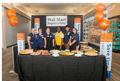
WAL-MART SUPERCENTER 121 Hwy. 332 W., Lake Jackson 979-297-9757