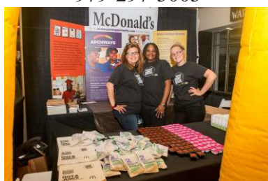
MCDONALD'S 923 Brazosport Blvd., Freeport 979-233-2381