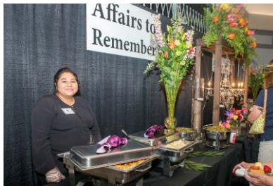
AFFAIRS TO REMEMBER 979-299-6585