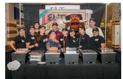
EL TORO 120 Commerce Street, Clute 979-265-5361