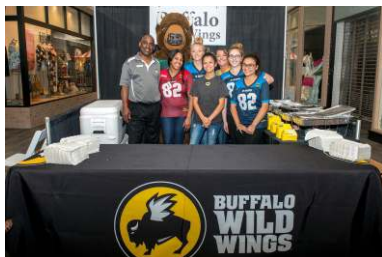
BUFFALO WILD WINGS 200 E. Hwy. 332, Ste. A, Lake Jackson 979-297-3614