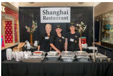
SHANGHAI 931 Hwy. 332, Lake Jackson 979-297-2782