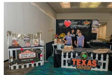
TEXAS ROADHOUSE 100 Hwy. 332, Ste. 1126, Lake Jackson 979-299-7427