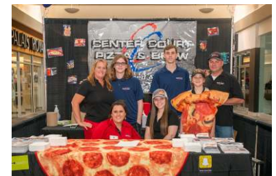
CENTER COURT PIZZA & BREW 810 N. Dixie Drive, Ste. M, Clute 979-265-2700