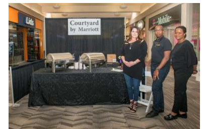
COURTYARD BY MARRIOTT 159 SH 288, Lake Jackson 979-297-7300