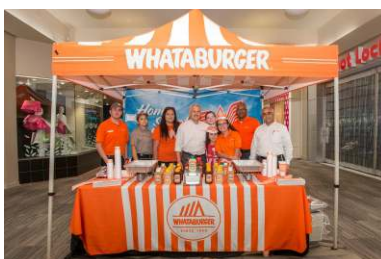
WHATABURGER 1405 W. Hwy. 332, Clute 979-299-1313