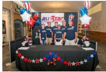
ALLSTAR PIZZA 202 That Way, Lake Jackson 979-297-2009