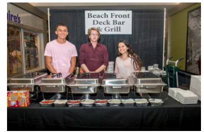
BEACH FRONT DECK BAR & GRILL 750 Bluewater Highway, Surfside Beach 979-709-5607