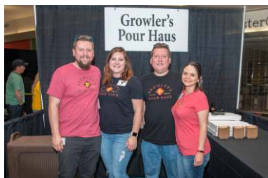
GROWLERS POUR HAUS 104 This Way, Lake Jackson 979-297-3003