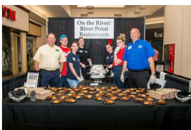
ON THE RIVER /RIVER POINT RESTAURANTS 919 W. 2nd, Freeport/111 Abner Jackson Parkway, Lake Jackson 979-233-1352/979-297-7444