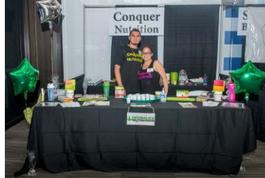
CONQUER NUTRITION 102-B Parking Way, Lake Jackson 979-236-6992