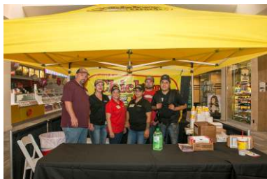
CHICKEN EXPRESS 105 Winding Way, Lake Jackson 979-292-8563