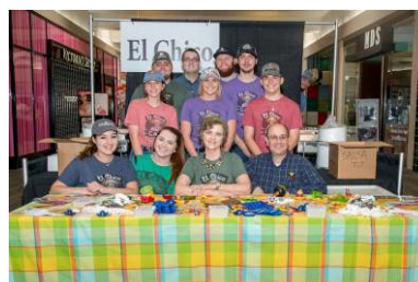
EL CHICO 100 Hwy. 332 W., Ste. 1232, Lake Jackson 979-297-4002