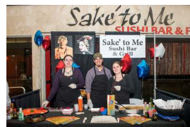
SAKE' TO ME SUSHI BAR & GRILL 100 Hwy. 332 W., Ste. 1386, Lake Jackson 979-316-3950