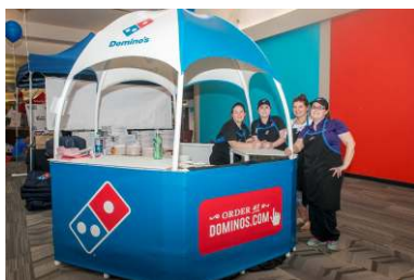
DOMINO'S 100 This Way, Lake Jackson 979-297-9797