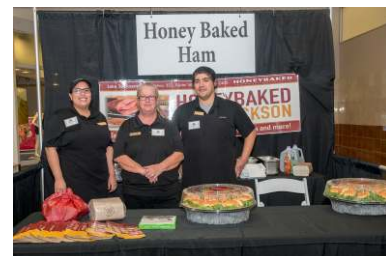
HONEY BAKED HAM 201 Hwy. 332 W., Lake Jackson 979-299-7400