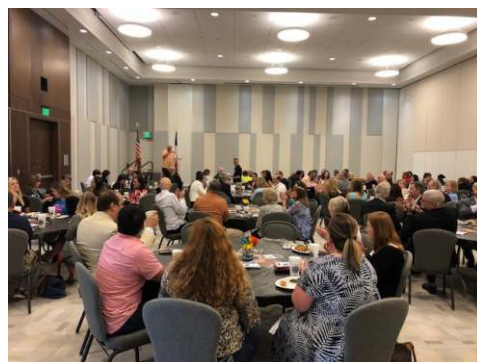
Thank you to our table sponsors: American Realty, BASF Corp., Brazosport I.S.D., Dow Chemical Company & Heritage Bank!