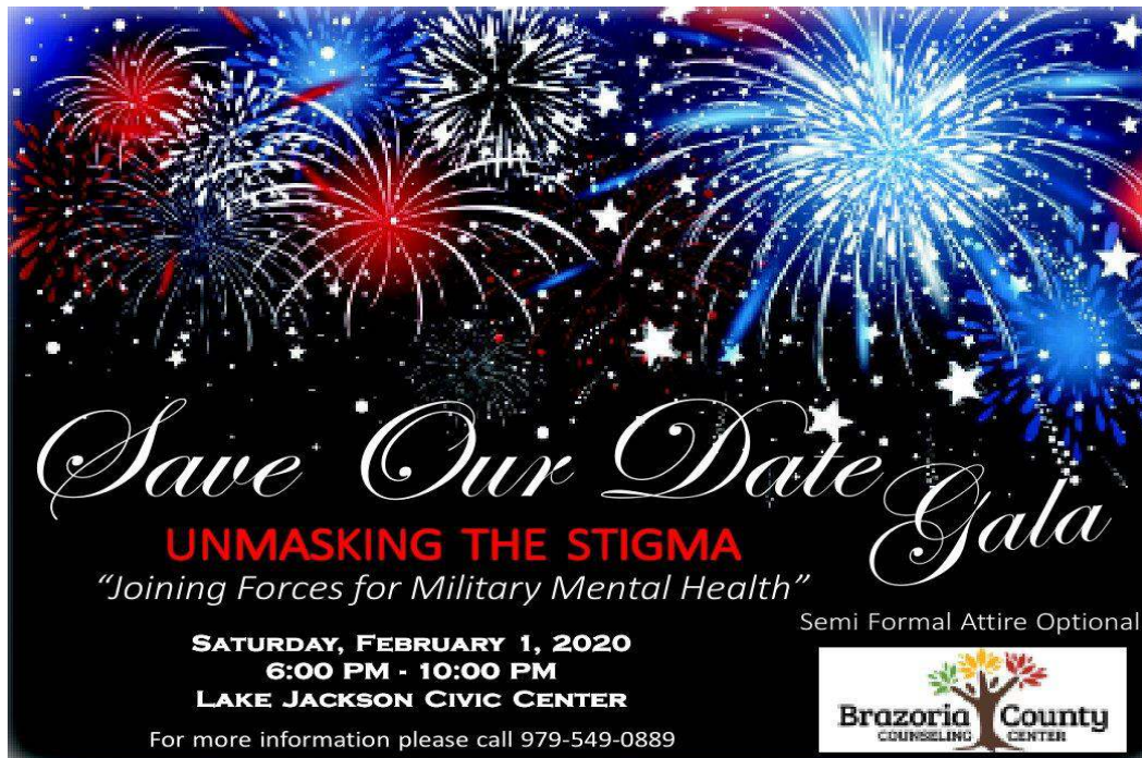
Table Sponsorships and General Sponsorship Opportunities are Available!

Also accepting SILENT or LIVE Auction items.