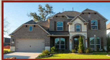
Anglia Home 202 Bentwater Ln., Clute (in the Woodshore Subdivision, follow the Anglia Homes signs)

Tickets $20 each and are available at the Chamber Office, Carriage Flowers, LJ Flower Co., Tammie's Touch & TBT Real Estate