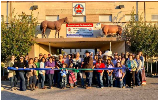
The Brazoria County Council of Chambers was proud to host a ribbon cutting for the 2019 Brazoria County Fair!