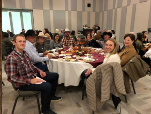
The MEGlobal Table