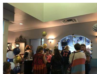
There was great food and door prizes at the Network Mixer!