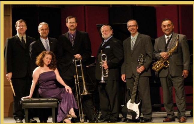
Jazz Sunday did a great job entertaining the crowd.