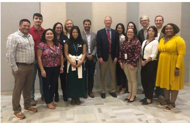
Dow Texas Operations employees.