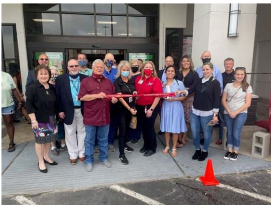
Ollie's Bargain Outlet 101 Dixie Drive, Clute 979-266-0196 www.ollies.us Retail