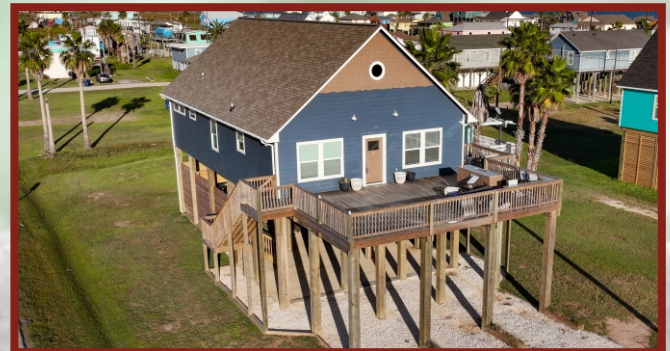
Marc & Nichole Smyth 322 Sundial St., Surfside Beach