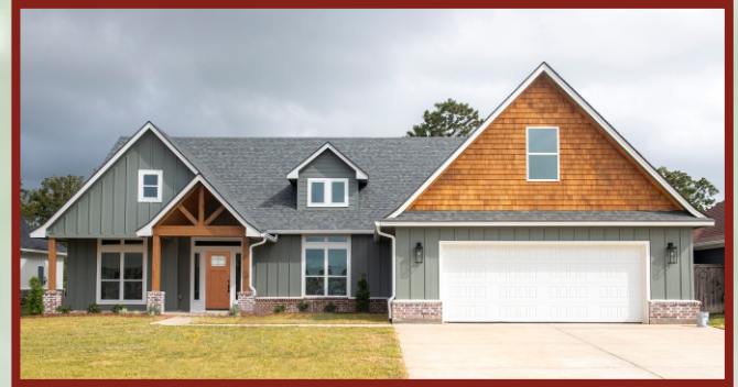
Aplin Homes 202 Creekside Ln., Lake Jackson