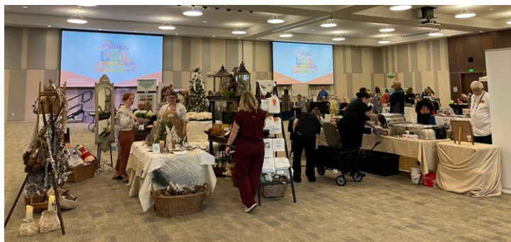
Many thanks to the vendors that participated in the Shop Local Showcase.

The Chamber partnered with The Economic Development Alliance and the Small Business Development Center at the Brazosport College to bring the FIRST EVER Shop Local Showcase event to life. Not only were businesses able to showcase and sell their merchandise, but educational business speakers were scheduled throughout the day in break-out sessions. This FREE event was held on October 18th from 10:00 a.m. to 2:00 p.m. at the Dow Academic Center and was open to all businesses. There were 30 vendors that participated and approximately 100 in attendance. Everyone enjoyed networking, shopping, and showcasing their products and services.