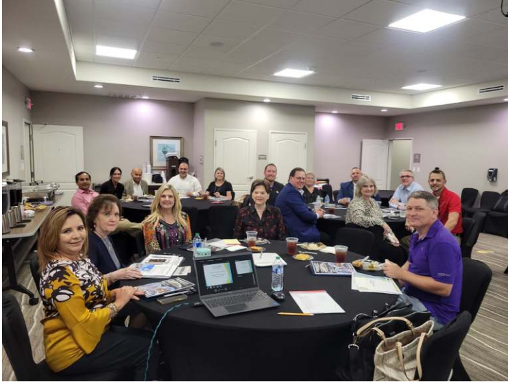
Current Board of Directors, incoming Board Members, Committee Chairs, and Staff at the Strategic Planning Session.