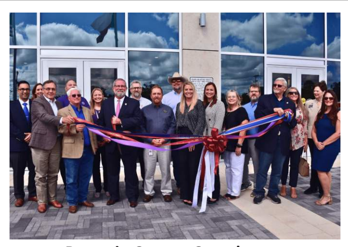
Administration Building 227 E. Locust Street, Angleton