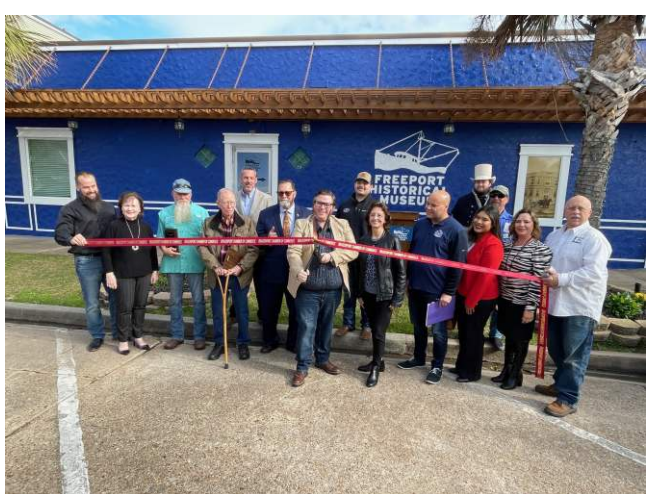
Freeport Historical Museum Grand Re-Opening & Newly Restructured Museum 311 E. Park Avenue, Freeport