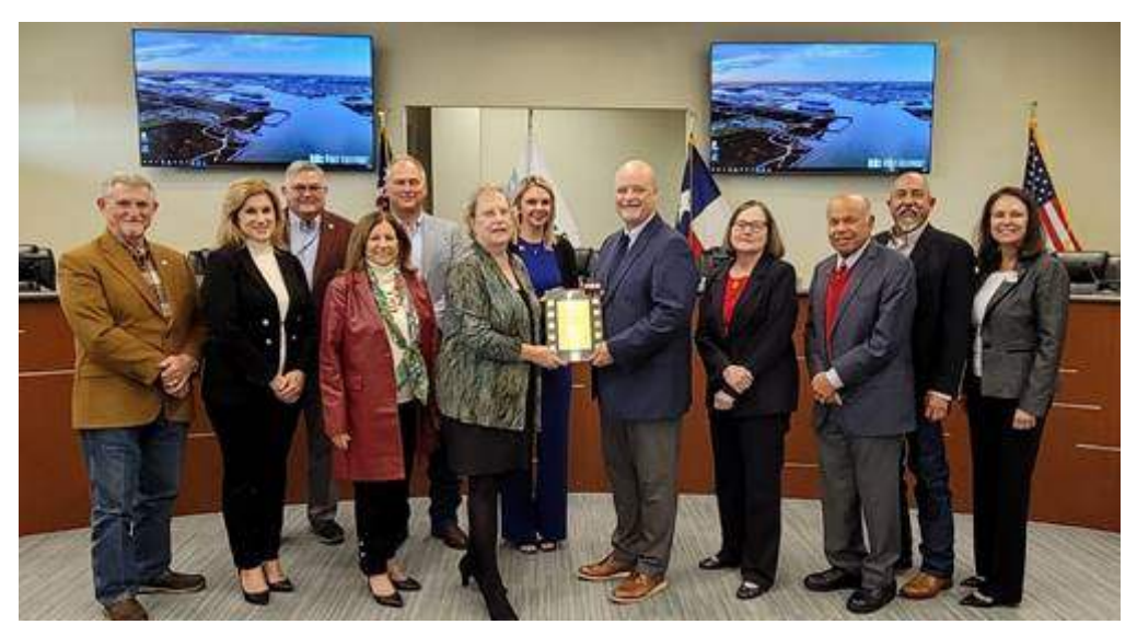
The GFOA Award is presented to members of the Accounting and Finance Department by Port Freeport Commissioners and Executive Staff.

The ACFR has been judged by an impartial panel to meet the high standards of the program, including demonstrating a constructive "spirit of full disclosure" to communicate its financial story and motivate potential users and user groups to read the ACFR. The GFOA is a major professional association serving more than 23,000 governmental finance professionals with offices in Chicago, IL and Washington, D.C.