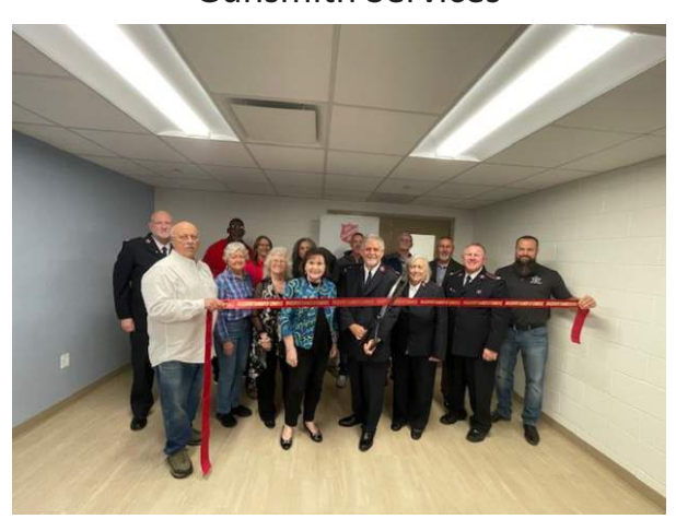
Salvation Army 1618 N. Avenue J Freeport, TX 7741

Firearms, Knives, Accessories, Training Classes & Gunsmith Services