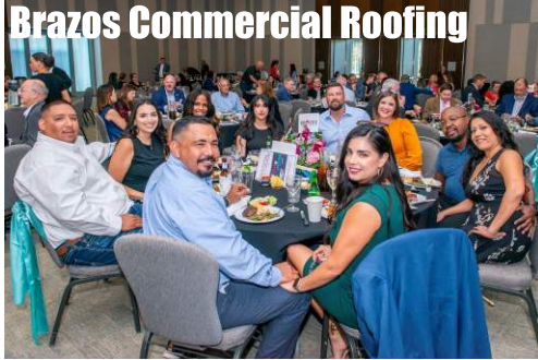
Brazos Commercial Roofing