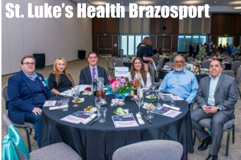
St. Luke's Health Brazosport