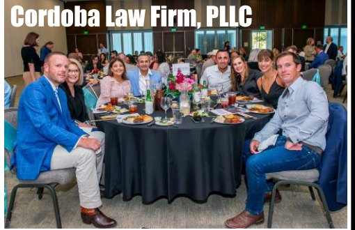
Cordoba Law Firm, PLLC