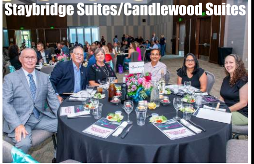
Staybridge Suites/Candlewood Suites