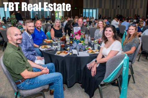
TBT Real Estate