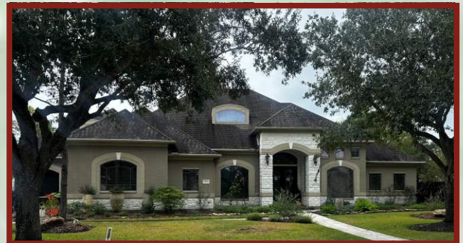
Judy Nolen 103 Spanish Oak Circle, Lake Jackson